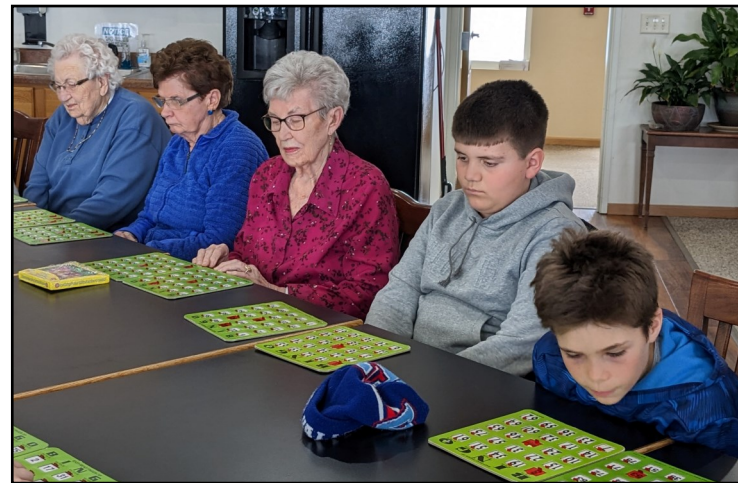
The Kids Club went to play BINGO with the residents at Legacy Place in March.