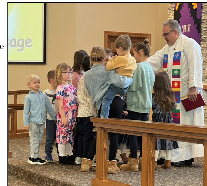
The kids blessing the noisy offering