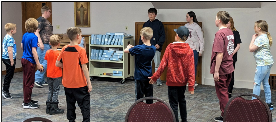
Early Dismissal Day—Fun and Games for K-6th Graders at Trinity

May 3—at Faith May 10—at Legacy Place May 17—Last Day of Kids Club for the 2022-2023 school year! (Extra Fun Day!)