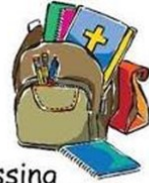
Blessing of the Backpacks

We will be blessing all kids (Preschool and up) and their backpacks as they begin their new school year on Sunday, August 21st! Children bring your backpacks with you to church on Sunday, August 21st.