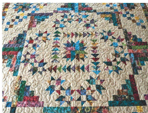
"WARMTH OF OUR STARS"