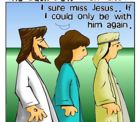
Jesus takes a post resurrection stroll 'incognito' on the road to Emmaus. Luke 24:13-35