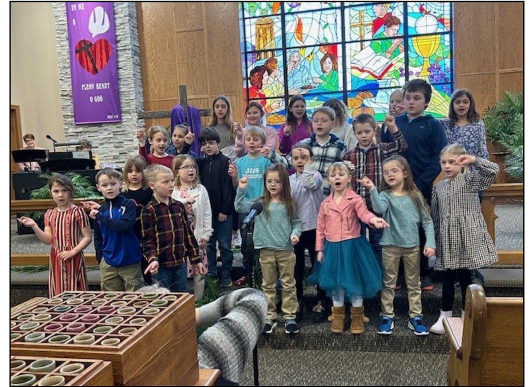
The Sunday School children processed in with palm branches, shared a Palm Sunday skit and sang two songs. They are awesome!