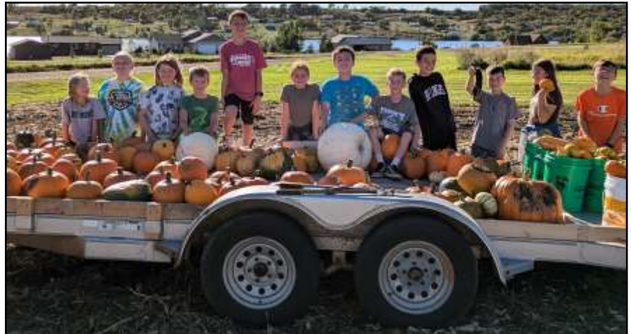
Kids Club picked the pumpkins for PUMPKIN BINGO

We welcome all kids going into 4th-6th grade to come to our Wednesday Afterschool program called Kids Club! Kids Club meets Wednesday from 3:15-5pm here at Faith or we go do a service project around the community. The kids are picked up by Wendi with the church van from Washington School and parents then pick them up from Faith.